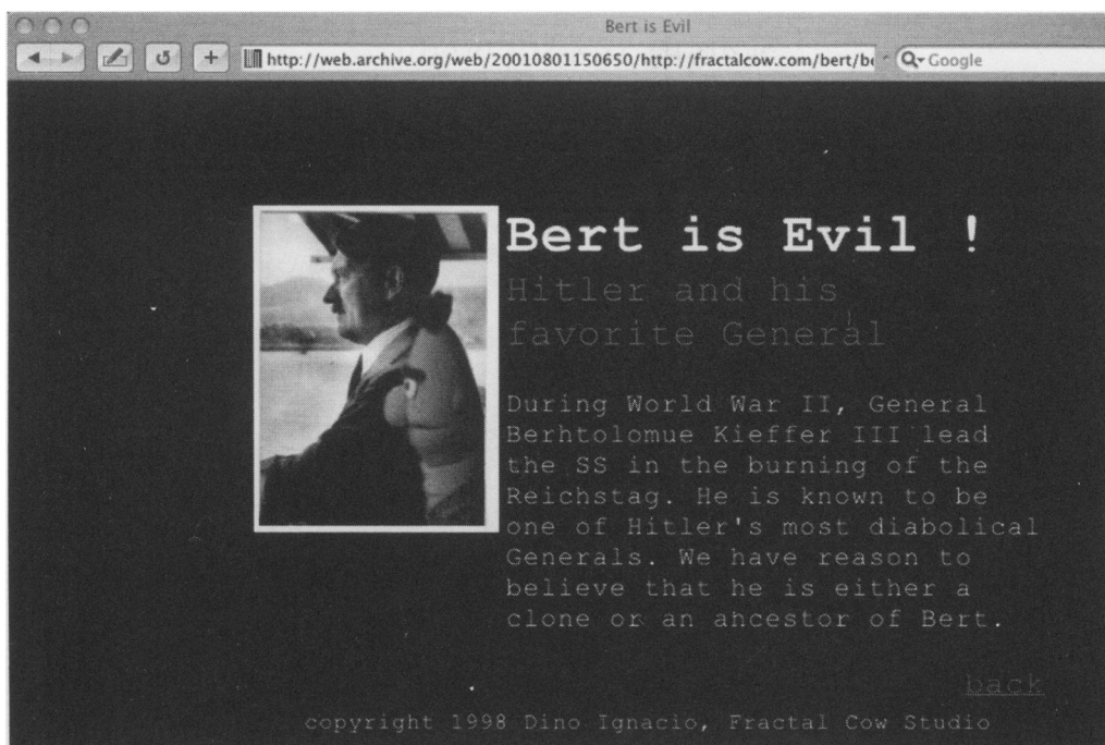
FIGURE 1: Bert the Muppet at Hitler's side, from the now defunct "Bert Is Evil!" web site.

Workshop, the show's producers, threatened legal action. On October 11, 2001, a nervous Ignacio pushed the delete key, imploring "all fans [ sic ] and mirror site hosts of 'Bert is Evil' to stop the spread of this site too." 2