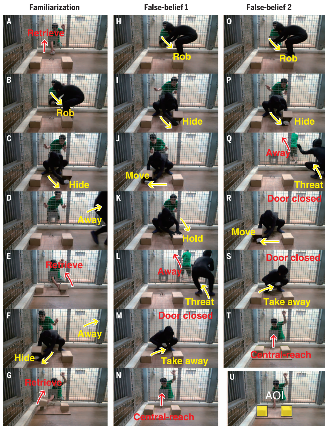
Fig. 2. Events shown in experiment two. (A to G) Familiarization. (H to M) Belief induction for the FB1 condition. (N) Central reach for FB1. (O to S) Belief induction for FB2. (T) Central reach for FB2. (U) AOIs defined for the target and distractor boxes. Following the infant study (10), we included an additional action in FB1 [KK touched the distractor box (K)] to control for subjects looking to the last place that the actor attended. See movie S2.

(FB1) or absent (FB2). In both conditions, the object was then completely removed before the agent returned to search for it. The actions presented during the induction phase controlled for several low-level cues—namely, that participants could not solve the task by simply expecting the agent to search in the first or last location where the object was hidden or the last location where the agent attended (10). Whether the object was hidden first in the left or right location during familiarization trials and whether the target of the agent's false belief was the left or right lo-