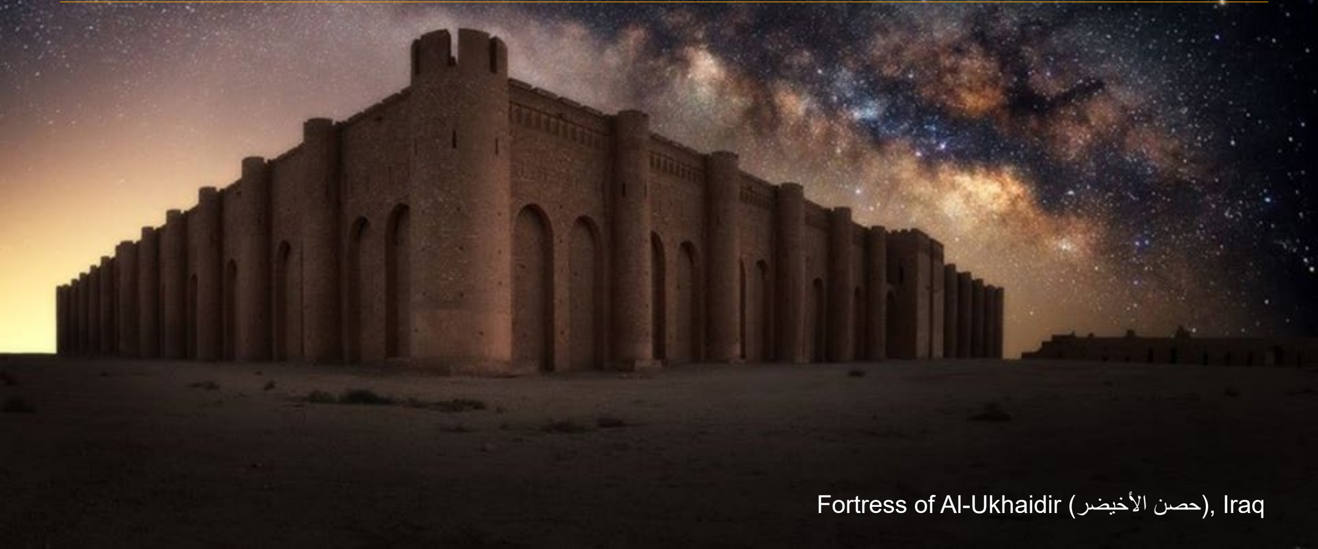
Fortress of Al-Ukhaidir (حصن الأخيضر), Iraq