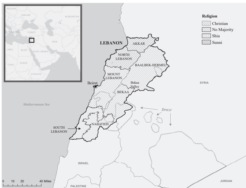
Map 3. The Communities of Lebanon

Lebanon was part of the Ottoman Empire until World War I and then briefly a French colony until it became independent in 1943. Since independence Lebanon has never held a census. There was one in 1932 which became the basis for a National Pact agreed in 1943, but nothing since then. The 1932 census found that Christians made up 51 percent of the population with a slight edge over the Shia, Sunni, and Druze Muslim communities in Lebanon (which are shown in Map 3). The pact recognized this configuration by dividing power between the various groups. For example, the president always had to be a Maronite Christian, while the prime minister would be a Sunni Muslim and the speaker of parliament a Shia Muslim. The division didn't stop there. The deputy speaker and the deputy prime minister always had to be Greek Orthodox Christians while the chief of the general staff of the armed forces would be a Druze Muslim. Representation in parlia-