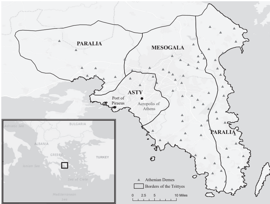
Map 2. The Athenian Demes

male citizens over the age of thirty, and because each could only serve for a year and at most twice in his lifetime, most Athenian men served at some point in their life. The Boule's president was randomly chosen and served for twenty-four hours, allowing most Athenian citizens to be in charge at some point. Aristotle summed all of this up by stating: