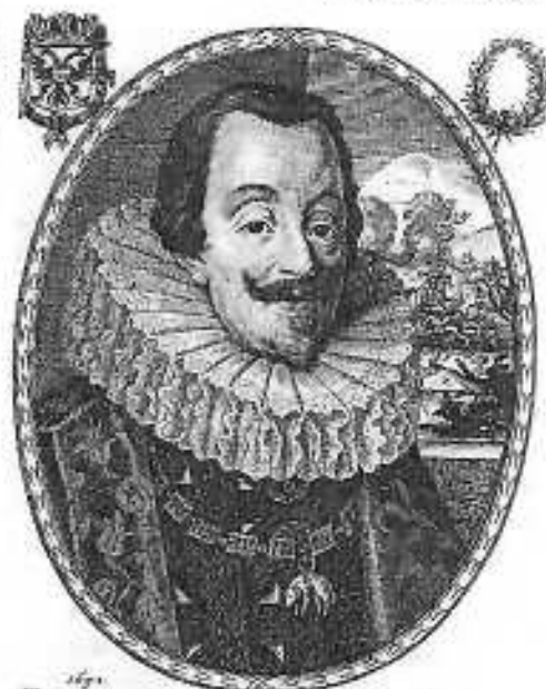
FERDINAND II PAR LA GRACE DE DIEU EMPEREUR DES ROMAINS

In Bohemia, Ferdinand imposed significant limitations on Protestant worship. In Prague, Calvinists and Lutherans began to look outside of Bohemia for potential support from Protestant princes. Protestant leaders convoked