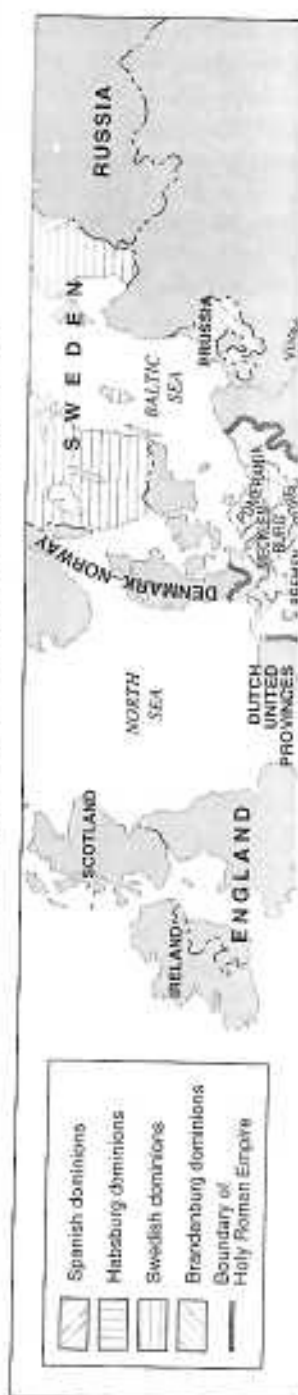
MAP 4.3 EUROPE AFTER THE TREATY OF WESTPHALIA, 1648 The treaty ended the Thirty Years' War

With minor exceptions, the territorial settlement reached in Westphalia remained in place until the French Revolution of 1789. For the most part, the treaty ended wars of religion in early modern Europe. It encouraged religious toleration, finally rewarding those people who had worked for and advocated religious toleration, or suffered intolerance and repression, during the long, bloody conflicts. The philosopher Baruch Spinoza (1632–1677), who had been forced to flee intolerance in Portugal, undoubtedly spoke for many when he wrote, "As for rebellions which are aroused under the pretext of religion . . . opinions are regarded as wicked and condemned