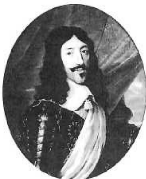
Philippe de Champagne's portrait of the sad-eyed Louis XIII.

decades of religious the assassination of Henry IV, and a fragile, temper- amental young monarch around whom plots swirled, the monar- chy of France had nonetheless been greatly strengthened, build- ing upon the accomplishments of his predecessor. Louis XIII's sometimes decisive and brutal actions enhanced the reputa- tion of the king who was known to many of his subjects as "The Just," whether fitting or not. A hypochondriac whose health was even worse than he feared, Louis XIII died of tuberculosis in 1643 at the age of forty-two. But the man-child monarch had, with Richelieu, laid the foundations for absolute monarchical rule in France.