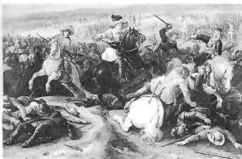
King Gustavus Adolphus of Sweden in battle.

barely a million inhabitants, was more than Gustavus, with an adventurer's disposition, could resist.