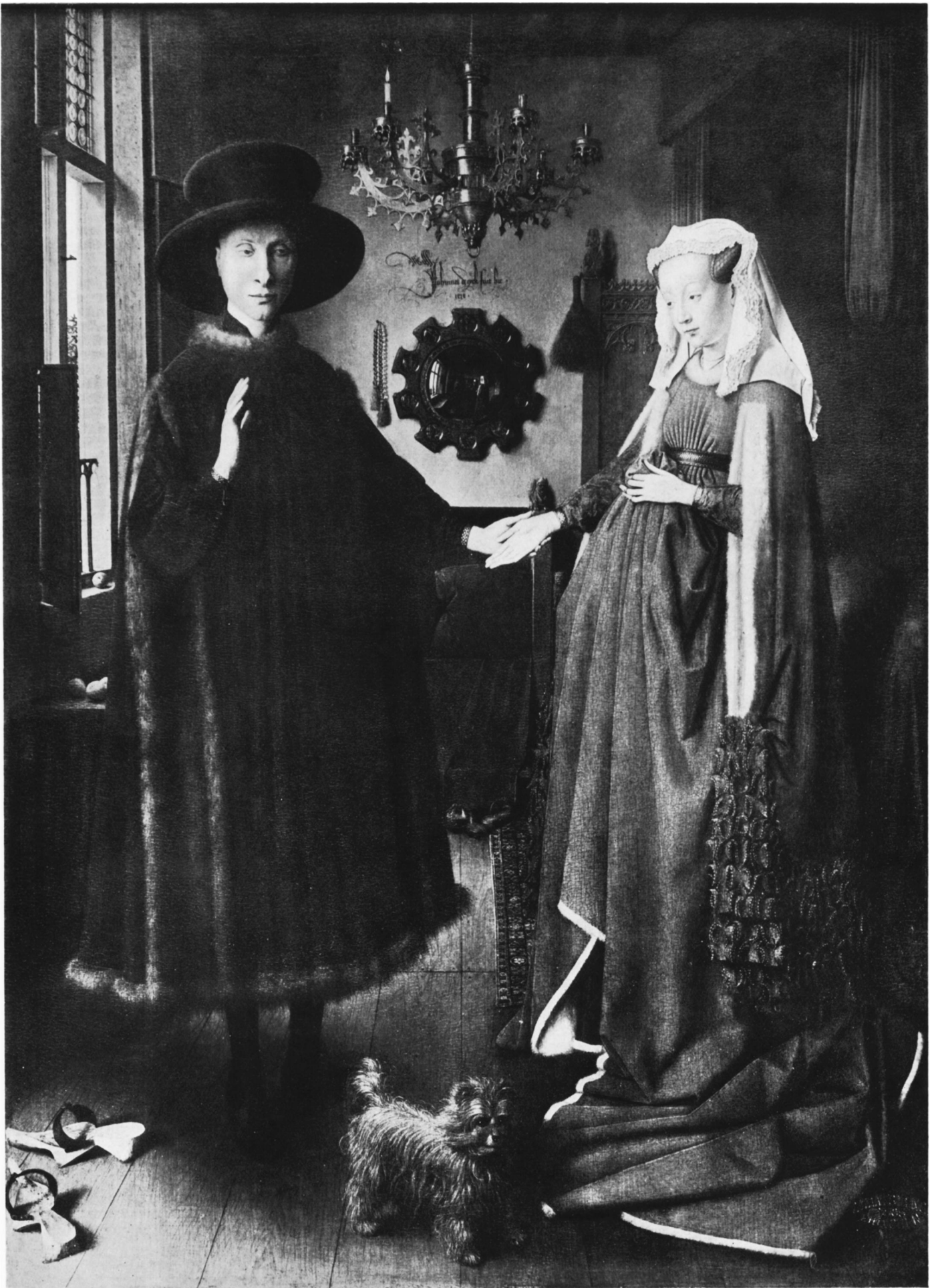
GIOVANNI ARNOLFINI AND HIS BRIDE, BY JAN VAN EYCK. PANEL, 83 BY 62 CM.