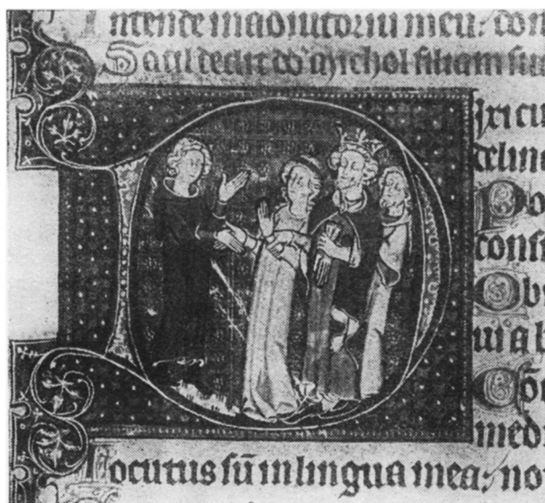
The Marriage of David and Michal , from a French Psalter of about 1323.

with representations of marriage ceremonies to be found, for example, in the Bibles Moralisées 25 or, even more à propos, in a French Psalter of about 1323 (Munich, cod. gall. 16, fol. 35). 26 In it, the marriage of David and Michal, the daughter of Saul, is represented in a very similar way as that of Giovanni Arnolfini and Jeanne de Cename, only the bride does not act of her own accord, but is given away by her father who is accompanied by a courtier and carries a glove as a symbol of his tutelary authority.