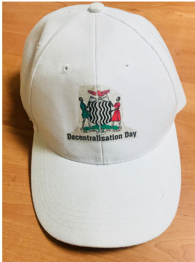
Figure 1. Hat from a 2013 event sponsored by Zambia's central government celebrating a decentralization process.

fostering more responsive political and civic institutions through local accountability (Bonnal n.d. ). The concept has had powerful advocates, but it also finds plentiful critics, who found voice especially through the movement alternately referred to as seeking 'anti-globalization' or 'global justice.'