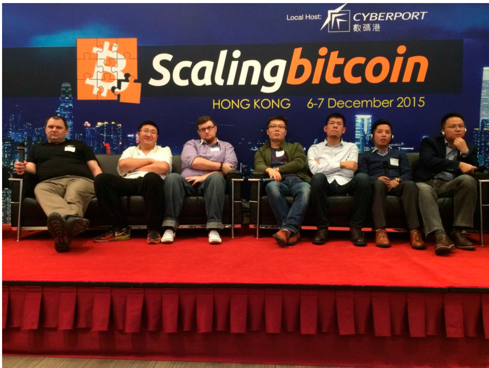
Figure 4. 'can we really say that the uncoordinated choice model is realistic when 90% of the Bitcoin network's mining power is well-coordinated enough to show up together at the same conference?' (Buterin 2017)

The Satoshi Oath further warns, 'If it becomes compulsory to take part in a decentralised system, the system itself becomes an oppressive authority in its own right' (Brekke 2016). Legal scholar Alan Cunningham (2016) contends that the more power blockchain protocols obtain, the less space remains for human agency. Galloway's thesis on the hegemony of protocols, written before Bitcoin